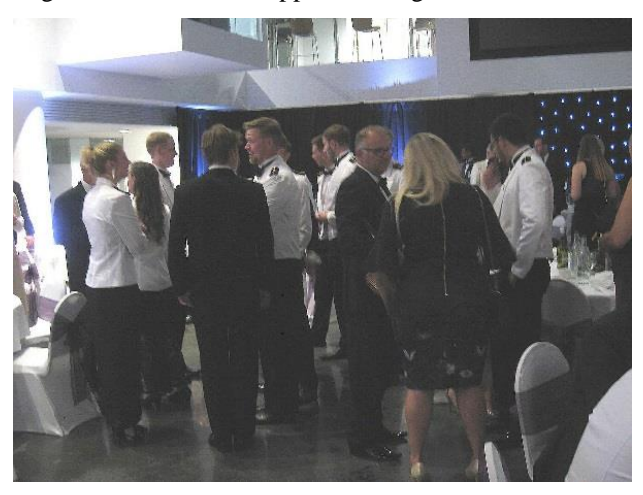
Warsash Maritime Academy cadets